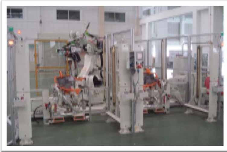
ROBOT WELDING JIG