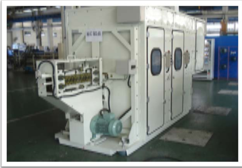
HOSE BRAIDING MACHINE