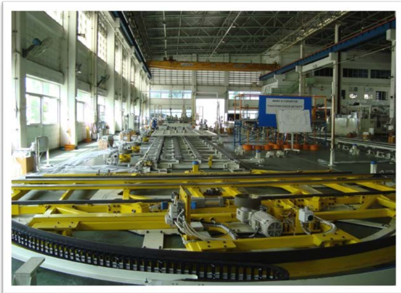
ASSEMBLY LINE COVEYOR